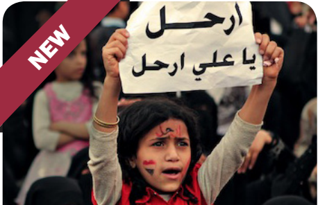
Academy Award Nominee Best Documentary, Short Subject

"Recommended. This film's use of a female voice to capture the emotional metamorphosis that the Egyptian masses are experiencing gives the viewer a very real sense of the fragility of the situation but also the hope and excitement that the youth of the country embody." —Educational Media Reviews Online